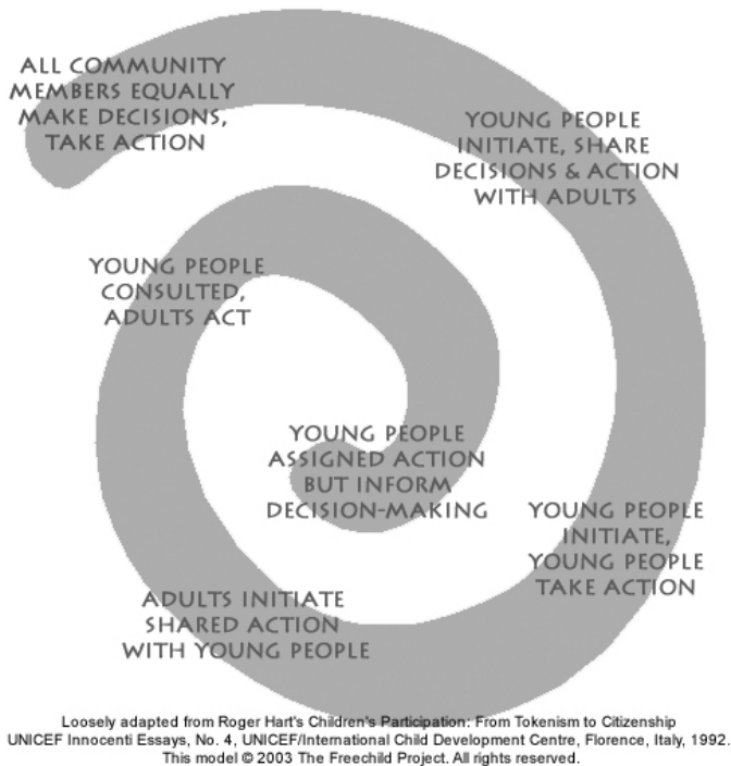
Figure 1. Measure of young people and social change.

The Freechild Project (2003) conceptualises participation thus: