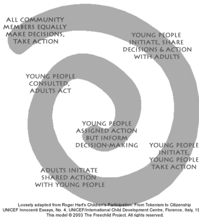
Figure 1. Measure of young people and social change.

The Freechild Project (2003) conceptualises participation thus: