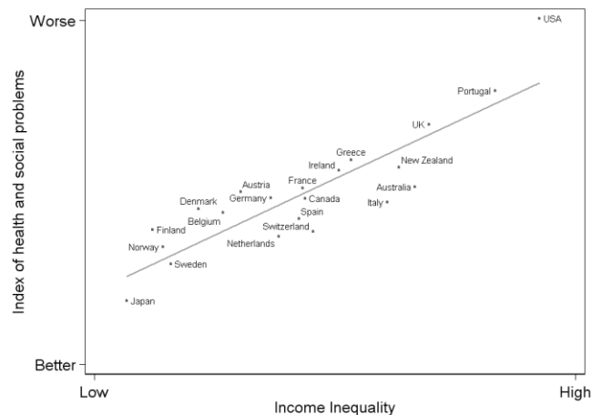
Figure 1. A scatter plot of 'Health and social problems' over inequality, for 21 of the 23 wealthy countries (Israel and Singapore are excluded for lack of data on some measures). From The Spirit Level , p20 (Figure 2.2).

The vertical axis is the index value and the horizontal axis is inequality. The solid line is the line of best fit through the scatter of points.